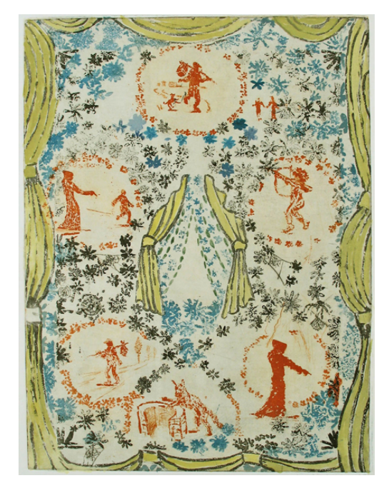
Scenes from the Fairy Tale Series etching with watercolor 25" by 19"

1979 "Pocket Art" Just Above Midtown Gallery, New York